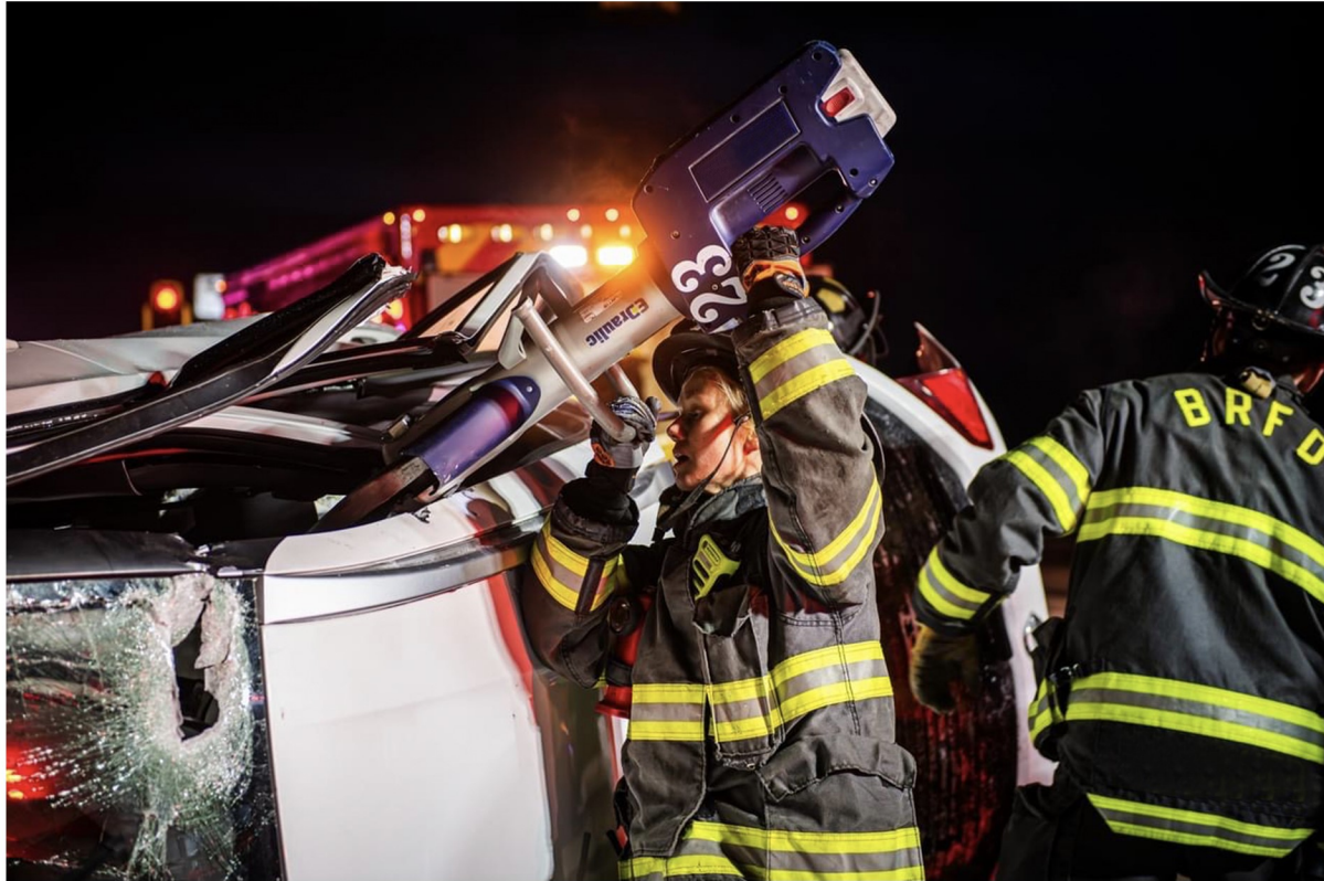
Code 10 Photography

0900 - 1700 Boulder County Regional Fire Training Center